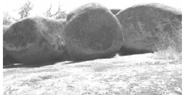
Rock Formation at Devil's Den

As I write this article, SB 288 and HB1083 are in a conference committee and one version of the bill is expected to be voted on by early May. Please help protect the streams and springs of south central Oklahoma by calling your representative and senator and asking them to vote yes on SB288/HB1083. For more information on the aquifer, current legislation and what you can do to help, see the extensive website of the Citizens for Protection of the Arbuckle Simpson Aquifer ( www.arbsimaquifer.net ).