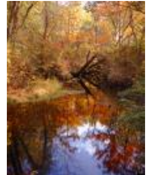
The Water Issue is on Hold