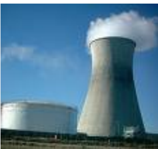
HB 1750 and SB 831 threaten to introduce nuclear energy in Oklahoma

"We do not believe it is realistic to expect that there are new reactor and fuel cycle technologies that simultaneously overcome the problems of cost, safety, waste, and proliferation."